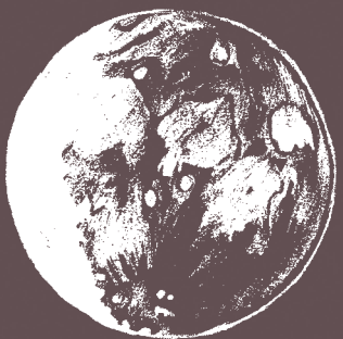
The night: la nuit